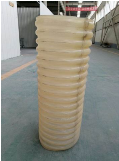
Silica gel connection